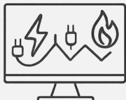
Energy Trading Desks