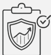
Risk & Valuation Control